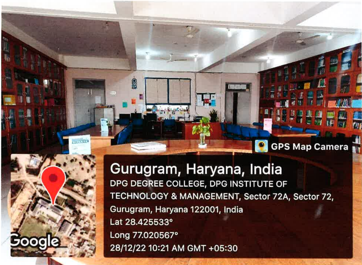
LIBRARY -01 (Block A) (Annexure 4.1.1. (6))

Institute provides 03 separate libraries for students which adequate number of syllabus books, reference books, Journals, newspapers and magazines. Library possess facility of NDLI (National Digital Library of India is a repository rich source which provide wide platform to learners in various languages and contains more than 4 crore items which includes e books and journals in various streams. Also, DPG library holds subscription of J Gate which opens gateway of unlimited journals and books to the learners. Library is working as per criteria and guidelines of DHE as well as MDU standards. Institute has enabled all 03 libraries with ERP software as well as DEL NET keeping in mind the latest demands and necessity of collegeand affiliating university. A well-structured and spacious Reading Hall is also associated with Library so that students may utilize their time while reading books with peaceful environment.