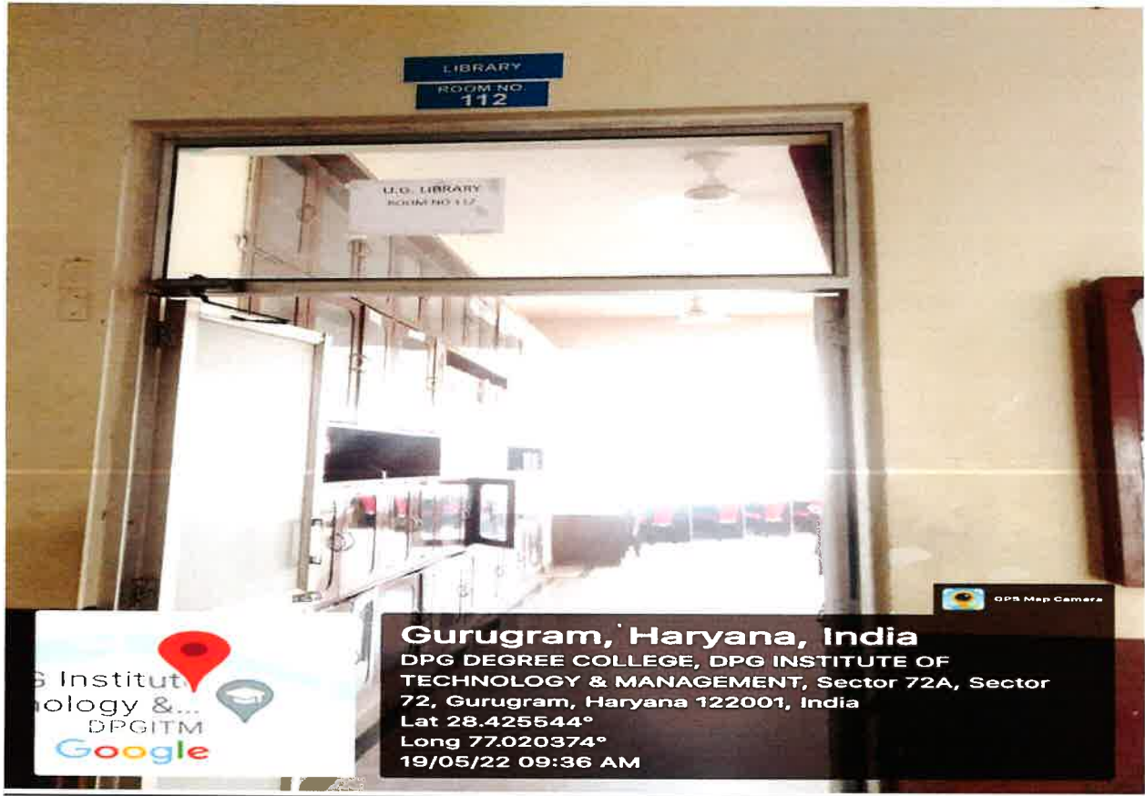
LIBRARY-2 (Block A)(Annexure 4.1.1. (6)