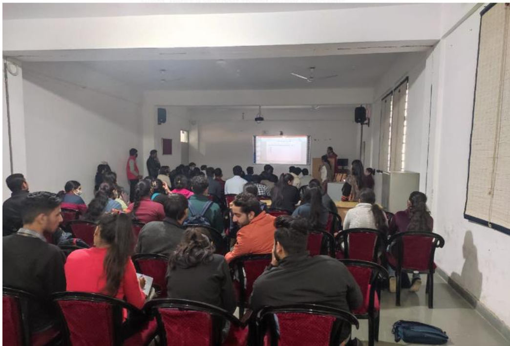
Declamation contest on National Mathematics Day, 2021