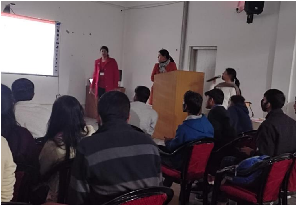
Quiz competition on National Mathematics Day, 2021