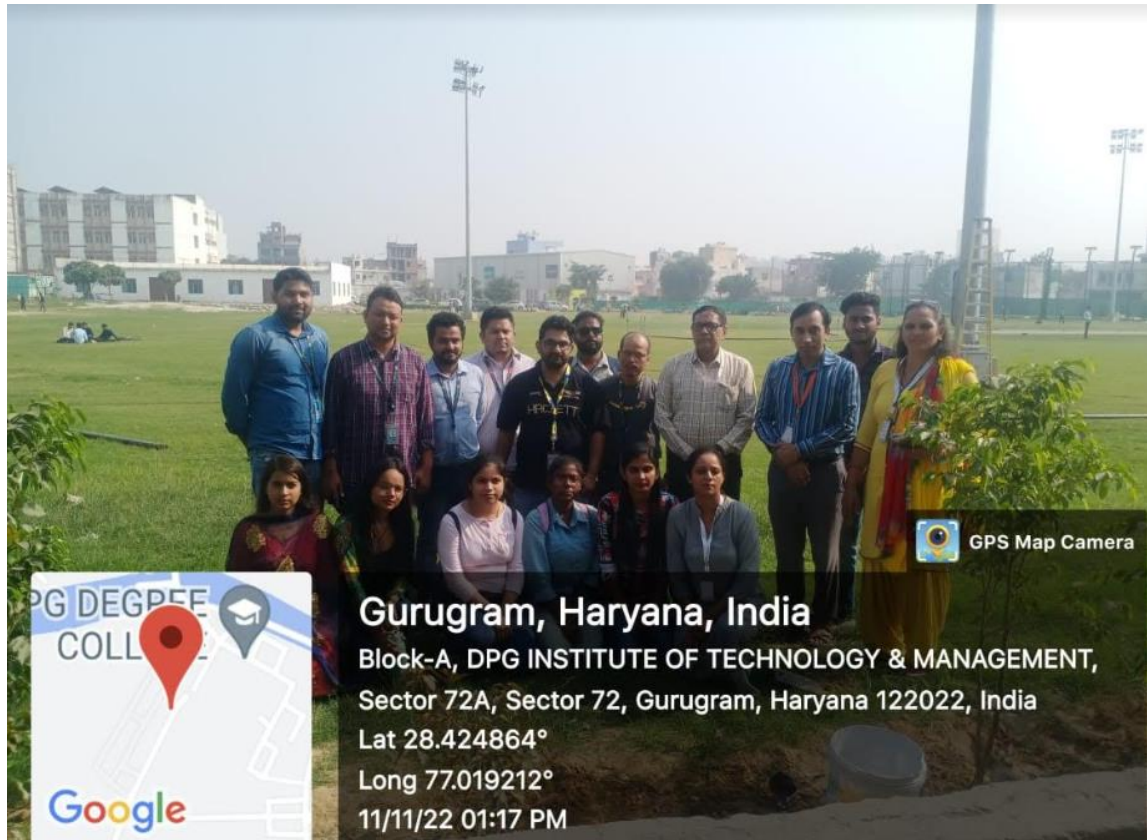
Team Amazon India participating in plantation with college faculties and students.