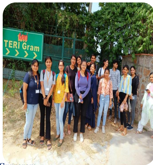
At TERI GRAM Gurugram