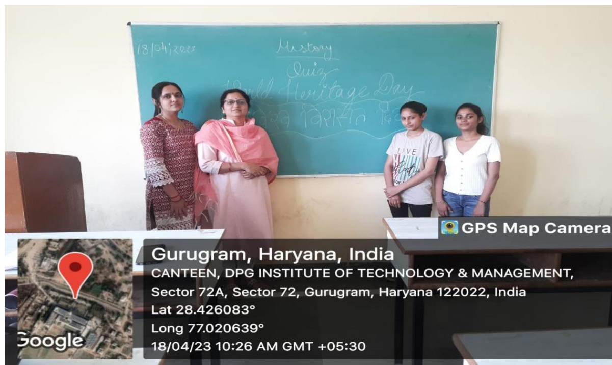
Celebrating “World Heritage Day” on 18 th April 2023