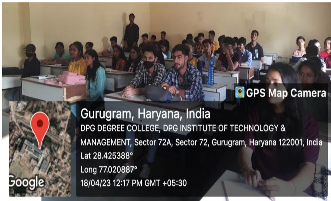
Students were told about the Indian Monuments which are included in WORLD HERITAGE. Which are preserved by UNESCO. Students explains their own views about their visit of QUTUB Minar.