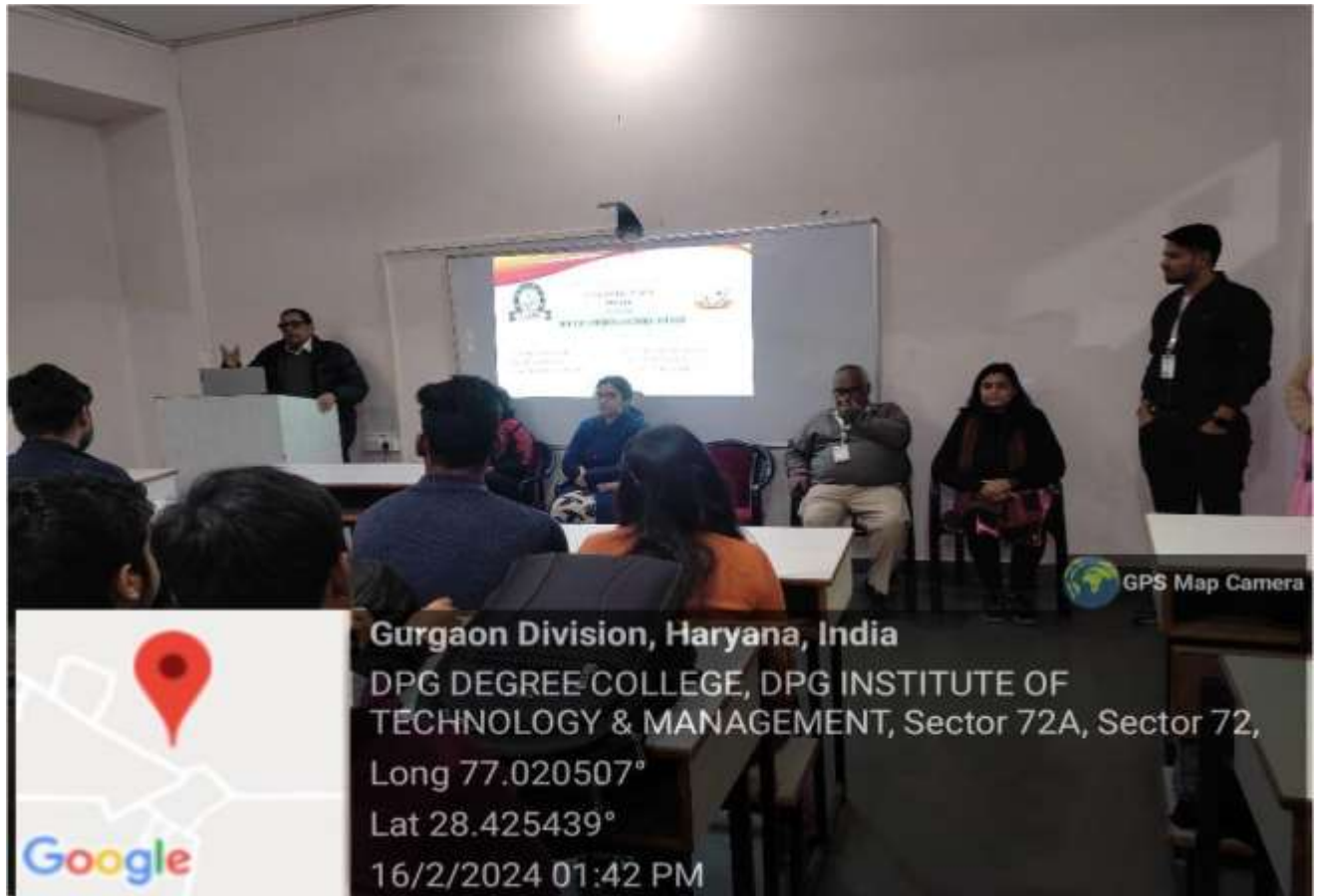
Fig: Principal Sir encouraging staff and students by his speech