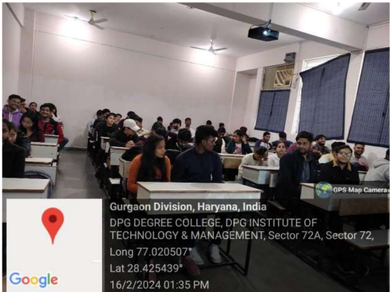
Fig: All the participants during the session.