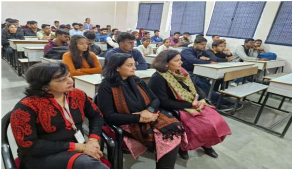
Fig: faculties and students are listening topic