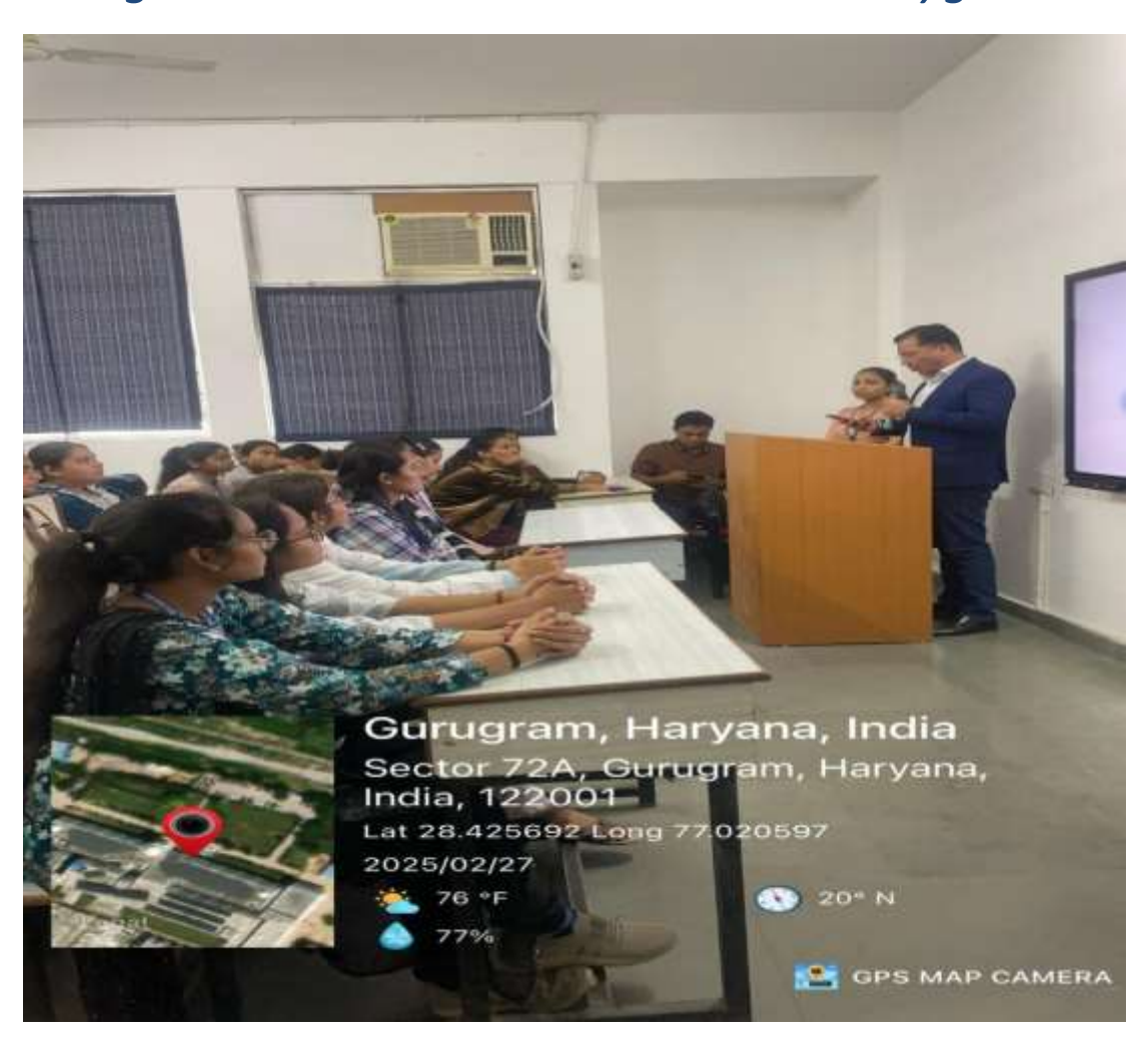
Figure 2: Several informative videos were shown to explain the impact of synthetic sanitary products and how organic alternatives contribute to better health.