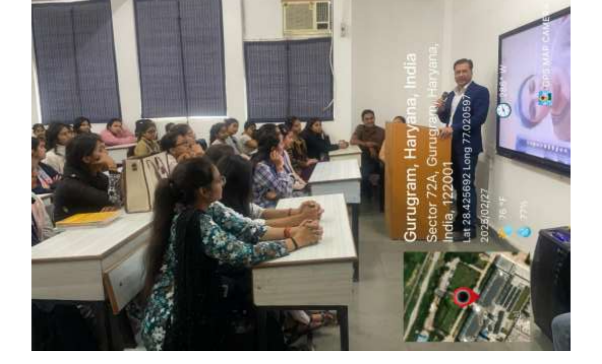
Figure 1: Extension lecture on Health hygiene