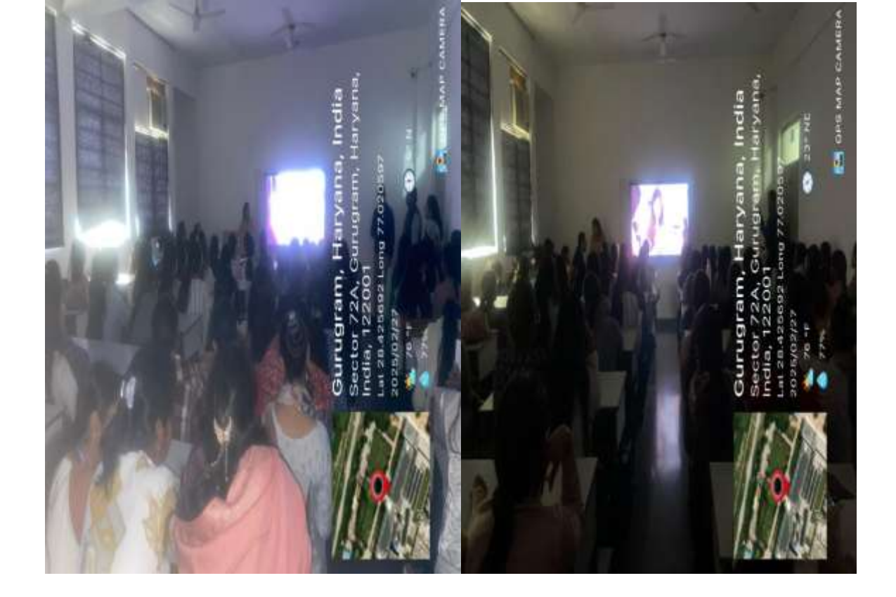
Figure 3: NSS volunteers, Staff and students listening to the lecture