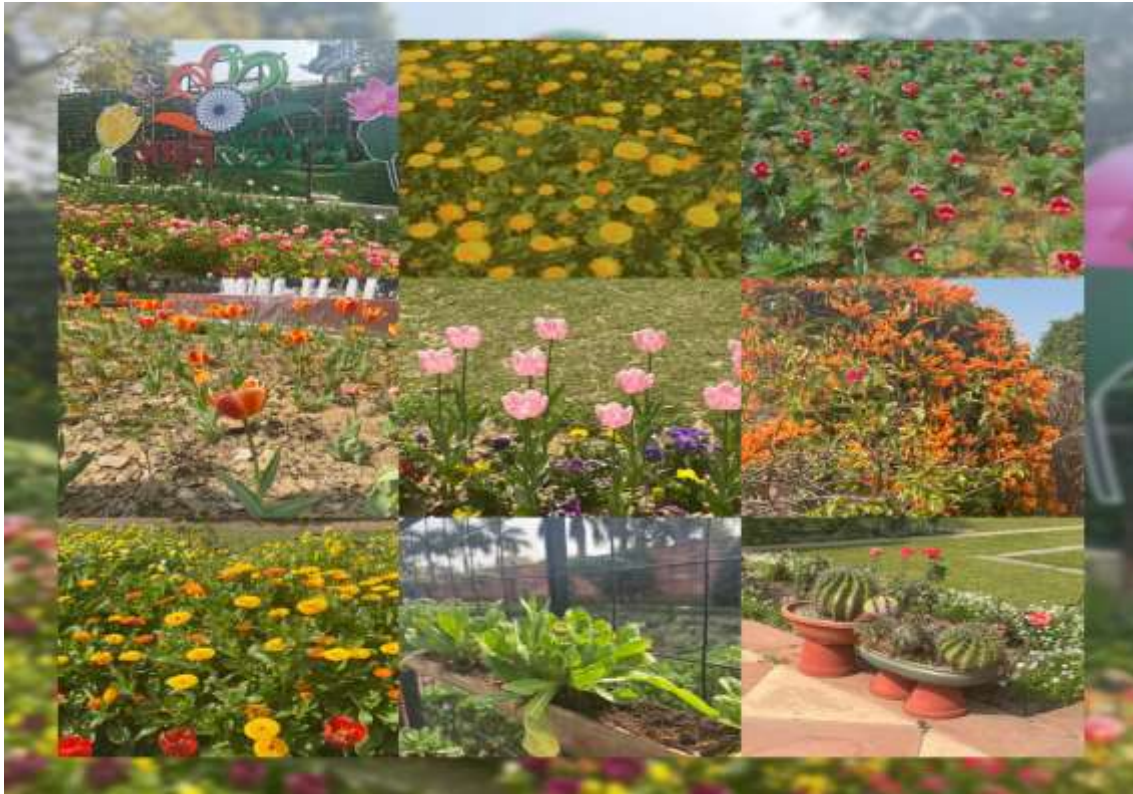
Biodiversity of Flora