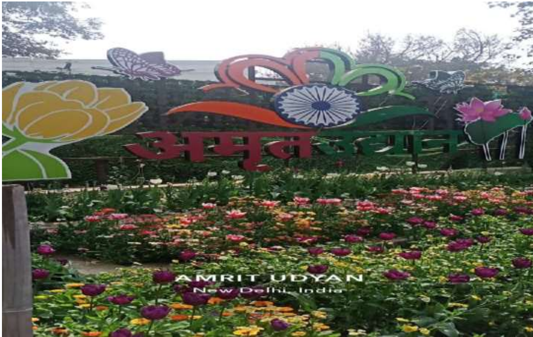
At the entrance of Amrit udyan, New Delhi