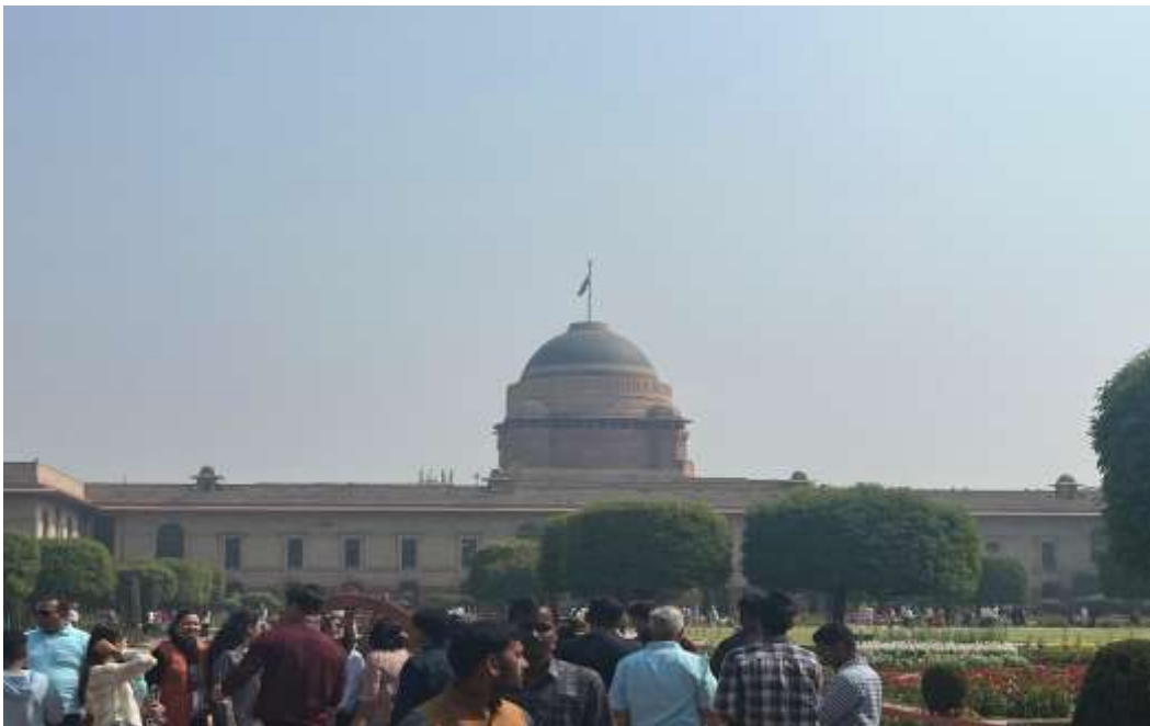
Rashtrapati Bhawan