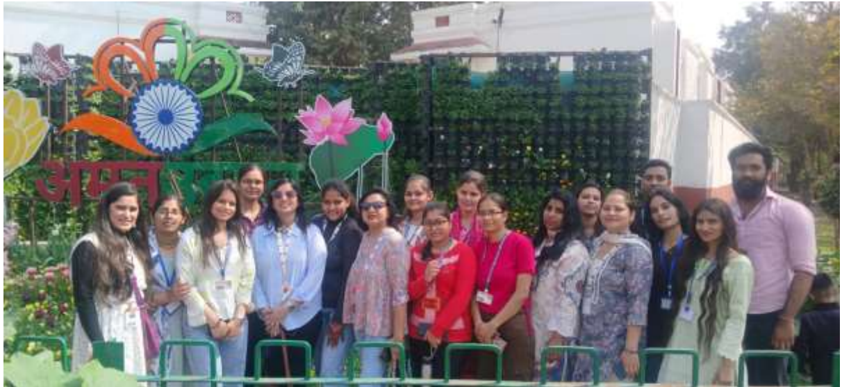
Group photo of students and faculty members during trip visit