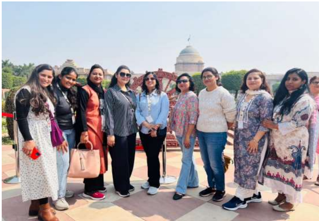
Group photo of life science faculty members