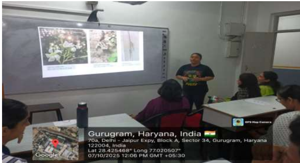
Student participated in wildlife photography